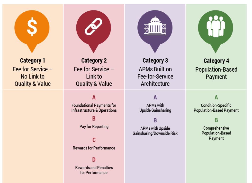
Figure 1. APM Framework (At-A-Glance)

With these principles in place, the Work Group began with the payment model classification scheme originally put forward by the Centers for Medicare & Medicaid Services (CMS), and subsequently reached a consensus on a variety of modifications and refinements. The resulting Framework is subdivided into four Categories and eight subcategories, as illustrated below: